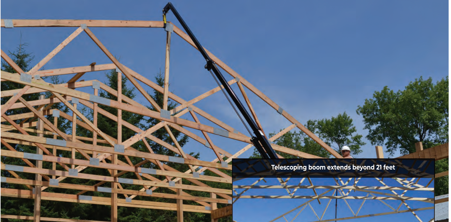
Telescoping boom extends beyond 21 feet